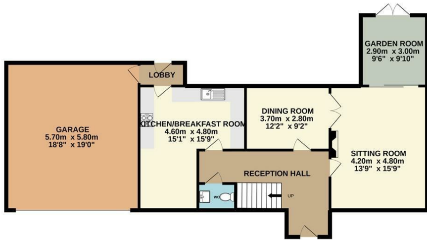
GROUND FLOOR 118.7 sq.m. (1277 sq.ft.) approx.